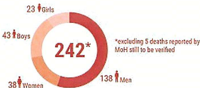
TOTAL FATALITIES SINCE 10 MAY 2021

During May 2021, Israeli occupying forces killed 269 Palestinians across occupied Palestine, including 75 children and 38 women, of whom four were pregnant. The overall number includes three people with disabilities, including a child.